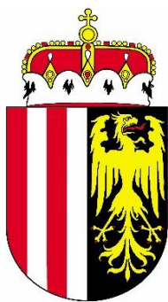
Thomas STELZER Governor of Upper Austria Upper Austria