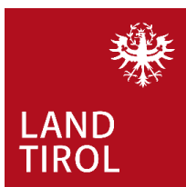
Günther Platter President of the Tyrolean Government Land Tyrol