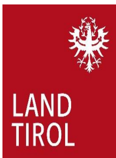
Günther Platter President of the Tyrolean Government Land Tyrol

President of the Autonomous Region of Sardegna